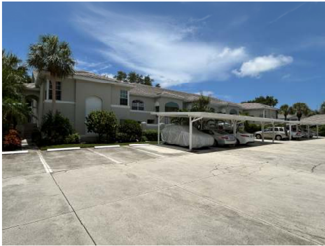
FRONT ELEVATION VIEW

R3 Inspections, LLC P.O. Box 152205 Cape Coral, FL 33915 Office: 239.810.7793 Email: radjrsas@yahoo.com